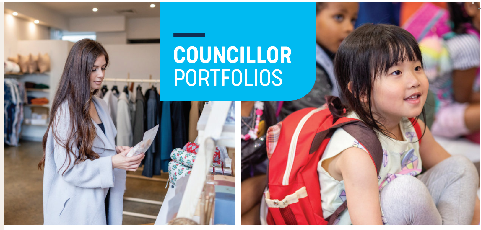
In each edition of Wyndham News we provide an insight into Wyndham's 11 Councillor Portfolios.