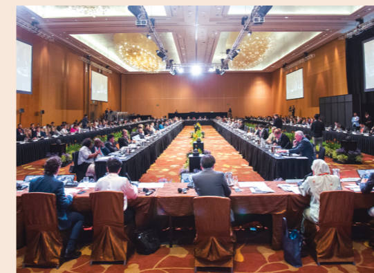
Mayors and city leaders at the 2018 WCS Mayors Forum

A by-invitation-only annual event, the WCS Mayors Forum is a global platform for mayors, city leaders, and frontrunners of international organisations to discuss pressing urban challenges and share best practices.