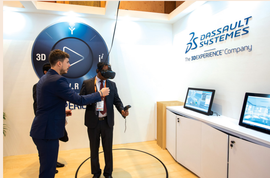
Sponsor booth at Cities @ City Solutions Singapore

Specially designed half-day tours offer World Cities Summit participants first-hand perspectives on how policies and ideas can be implemented successfully. Each site visit is a unique learning experience that provides a behind-the-scenes look at real issues.