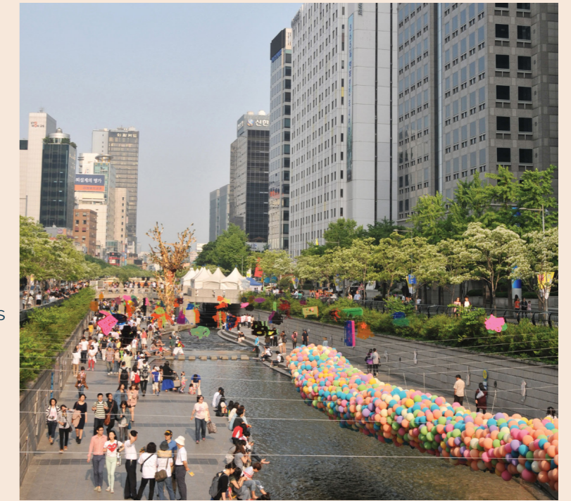
2018 Lee Kuan Yew World City Prize Laureate: Seoul

The Lee Kuan Yew World City Prize is a biennial international award that honours outstanding achievements and contributions to the creation of liveable and sustainable urban communities around the world. The lecture and forum discussions focus on four key pillars of every city's success: liveability, vibrancy, sustainability and quality of life. The award ceremony and banquet celebrates the winners of the prize and is a prestigious networking occasion.