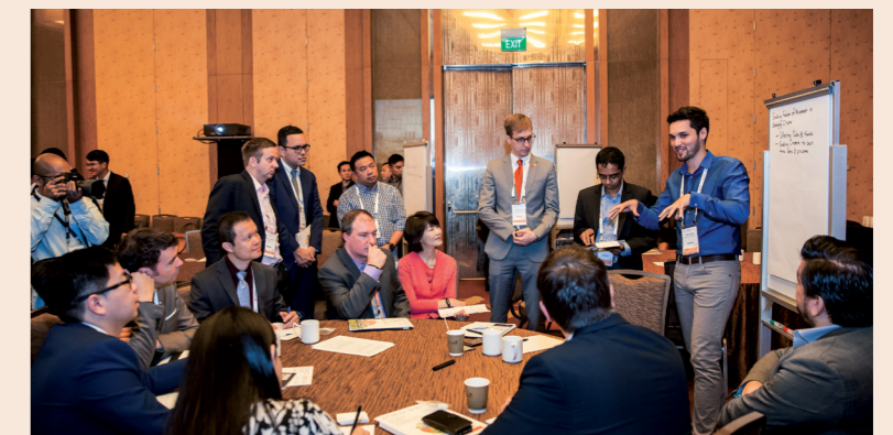
Discussions at the Young Leaders Symposium

The Symposium is an annual gathering of WCS Young Leaders, a group of change makers from diverse sectors who shape the global urban agenda. These passionate leaders discuss ways to tackle challenges such as planning for urbanisation and making cities more inclusive by creating better access to opportunities like affordable housing, sustainable transportation, accessible education and meaningful employment.