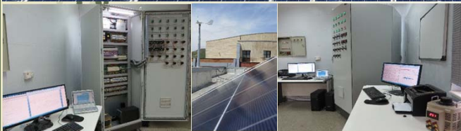
Life Long Learning Unit