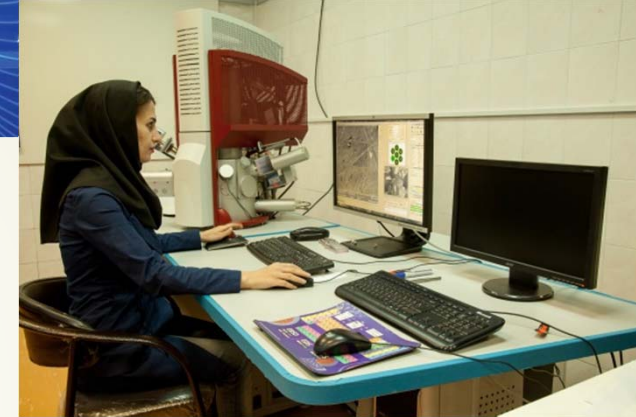
Water Sciences & Engineering Center